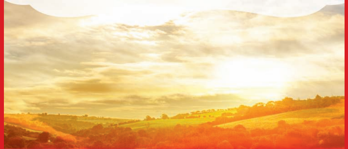
Excerpts from the Lectionary for Mass ©2001, 1998, 1970 CCD. Cover Design ©Liturgical Publications Inc.

Ask and you will receive Seek and you will find Knock and the door will be open Believe and your prayers will be answered