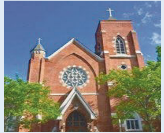
ST. PATRICK AND ST. BRIGID